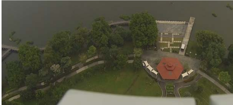
LakeSide Trial (After Range Alignment and Autofocus)